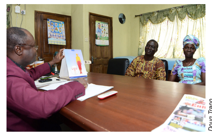
A provider at AGAPE medical center in Lagos counsels a couple on their family planning options.

This summary is based on research conducted by the SHOPS project. For more information, contact info@shopsproject.org.