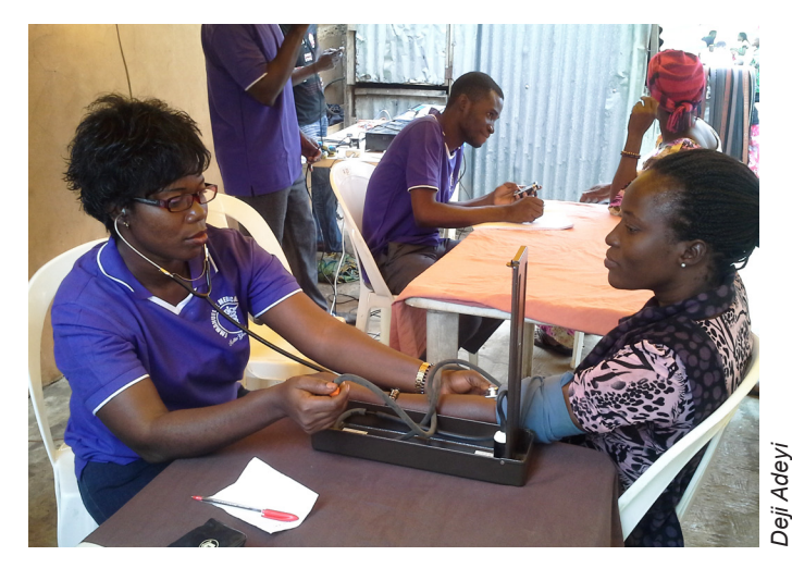
A woman receives a blood pressure screening at a health outreach event hosted by Immanuelle Medical Clinic, a private facility.